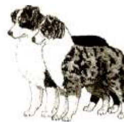
Merle bitch with Tri dog in background Trim color is optional and not to be preferred

GENERAL APPEARANCE: The Miniature Australian Shepherd is a well-balanced herding dog of small to medium size. Bone is also moderate and in proportion to body size. He is attentive and animated, showing strength and stamina combined with unusual agility. Slightly longer than tall, he has a coat of moderate length and coarseness with coloring that offers variety and individuality in each specimen. An identifying characteristic is his natural or docked bobtail. In each sex, masculinity or femininity is well defined. Disqualifications: Toy like features (i.e. domed head, bulging eyes, fine bone)